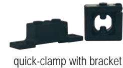
quick-clamp with bracket