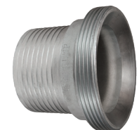
6" and 8"