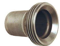
3" and 4"