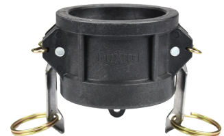
3/4" - 3"