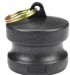
3/4" - 3"