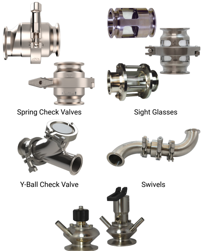
Spring Check Valves